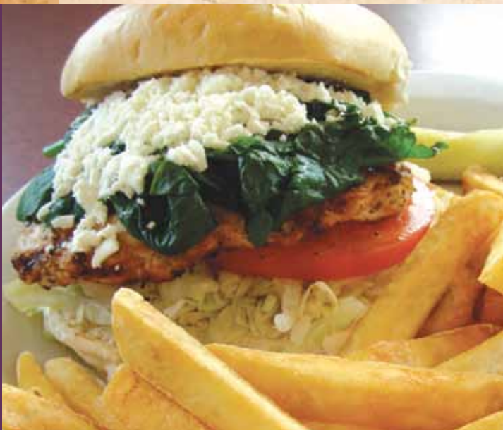
Chicken Spinach Supreme Charbroiled chicken breast, spinach, Feta cheese, lettuce, tomato, mayonnaise on hard roll. $7.99

Served with French Fries, Cole Slaw, Pickle